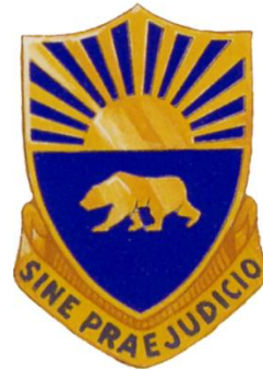
DISTINCTIVE UNIT INSIGNIA

Constituted 29 July 1921 in the Organized Reserve as the 308 th Military Police Battalion, assigned to XVIII Corps, and allotted to the Eighth Corps Area. Organized 27 July 1922 at Hillsboro, Texas. Relieved 2 July 1923 from assignment to XVIII Corps and assigned to VIII Corps. Relocated 15 April 1925 to Waco, Texas. Withdrawn 13 January 1927 from the Eighth Corps Area and allotted to the Seventh Corps Area. Inactivated 4 April 1927 at Waco by relief of personnel. Organized in July 1927 at Lincoln, Nebraska. Withdrawn 1 October 1933 from the Seventh Corps Area and allotted to the Ninth Corps Area. Concurrently relieved from VIII Corps and assigned to IX Corps. Reorganized 17 December 1937 at Fresno, California. Withdrawn 1 January 1938 from the Organized Reserve and allotted to the Regular Army as a Regular Army Inactive (RAI) unit. Redesignated 1 June 1940 as the 508 th Military Police Battalion.