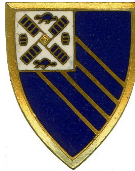
DISTINCTIVE UNIT INSIGNIA

Constituted 15 October 1921 in the Organized Reserves as the 321 st Military Police Battalion, assigned to Fourth Army, and allotted to the Second Corps Area. Organized in January 1922 at New York City, New York. Attached 17 September 1925 to the 61 st Cavalry Division for administration and training. Designated mobilization station was Camp Dix, New Jersey. Relieved from assignment to Fourth Army 1 October 1933 and assigned to First Army. Conducted annual summer training at Blauvelt, New York, in 1925, Fort Wadsworth, New York, in 1927, and with the 26 th Infantry at Plattsburg Barracks, New York, during 1930-38. Inactivated 1 January 1938, concurrently withdrawn from the Organized Reserves and allotted to the Regular Army. Redesignated 11 June 1940 as the 521 st Military Police Battalion.