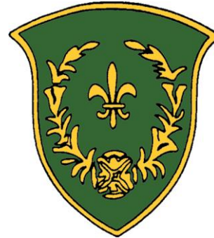
DISTINCTIVE UNIT INSIGNIA

Organized September 1917 at Camp Zackary Taylor, Kentucky as part of the 309 th Train Headquarters and Military Police, an element of the 84 th Division. Demobilized in 1919 at Camp Sherman, Ohio. Reconstituted 20 July 1921 in the Organized Reserve as the 309 th Military Police Battalion, assigned to XIX Corps, and allotted to the Ninth Corps Area. Organized 21 July 1922 at Los Angeles, California. Relieved 2 July 1923 from assignment to XIX Corps and assigned to IX Corps. Relieved 18 October 1927 from assignment to IX Corps and assigned to XIX Corps. Conducted annual summer training most years at Fort MacArthur, California, and some years at Fort Ord, California. Redesignated 11 June 1940 as the 509 th Military Police Battalion.