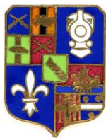
383 rd MP Bn