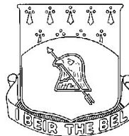
115 th AAA (Gun) Bn