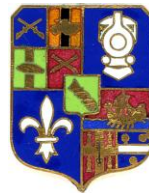
381 st MP Bn